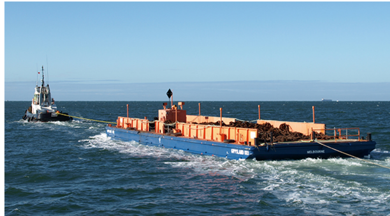
Gippsland under tow with an offshore oil rig's anchor chain