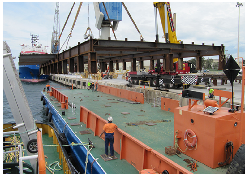
Loading construction jigs in Geelong, Victoria