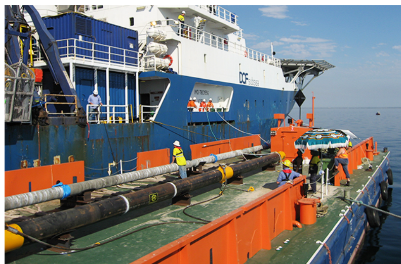
Working platform during the repair of a damaged ethane pipeline in Port Phillip Bay