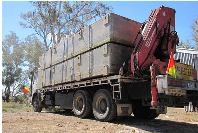
Crane Truck loaded with two 6m Aluminium pontoons