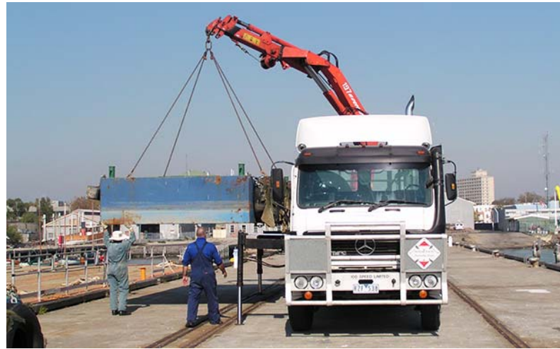
Crane Truck unloading a 6m Steel pontoon