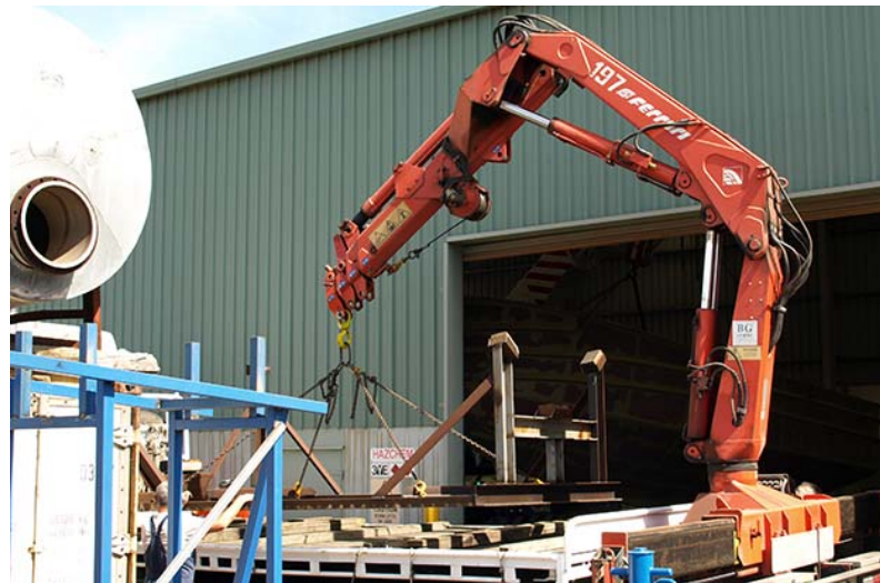
Crane Truck relocating boat cradle at the company's workshop